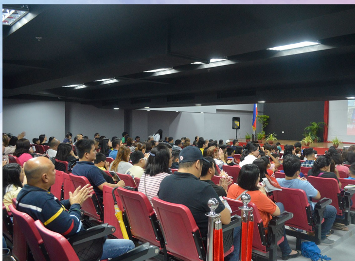
Welcome New Parents. The parents of the new pupils from Grade 1 to 6 who attended the orientation program.