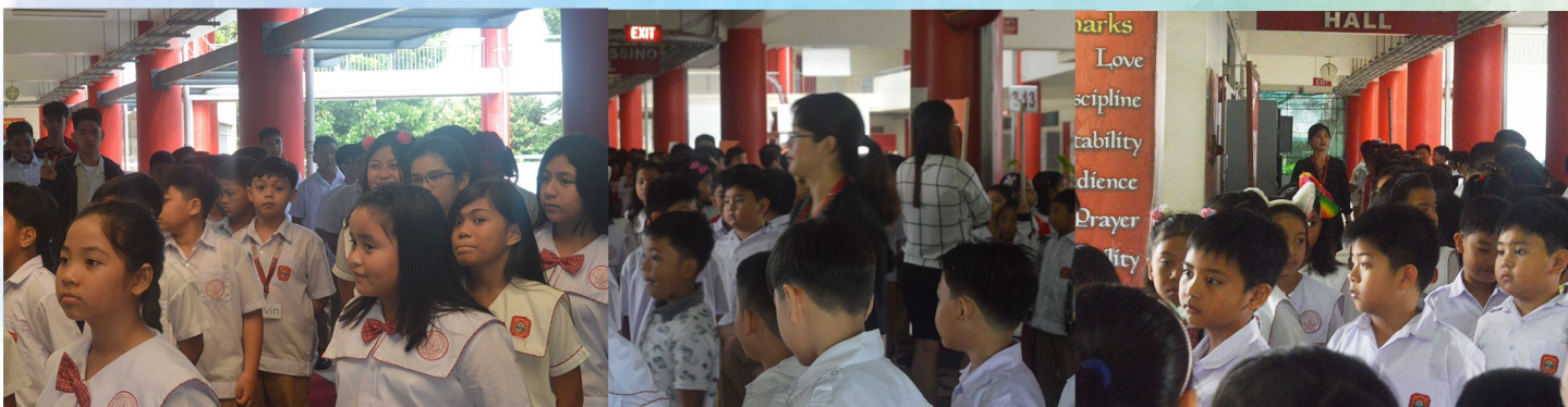
The Grade School pupils on their way to the Jarrow Hall for the First General Assembly.