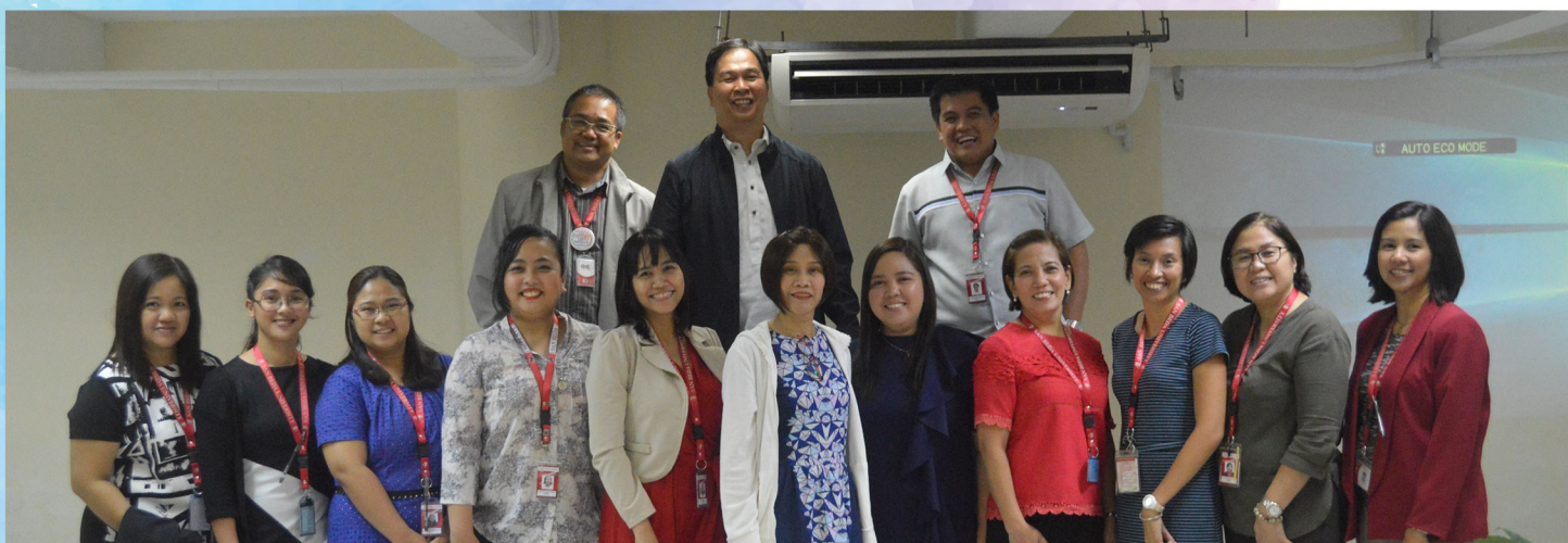
Success. The administrators, faculty, and guidance facilitators for Kinder after the orientation program for new parents of Kinder pupils last June 13, 2018 at the Learning Resource Center.