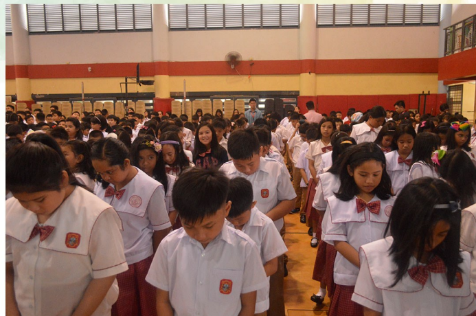
Bow your heads. The Bedan pupils while waiting for the final blessing of the Vice Rector and School Chaplain