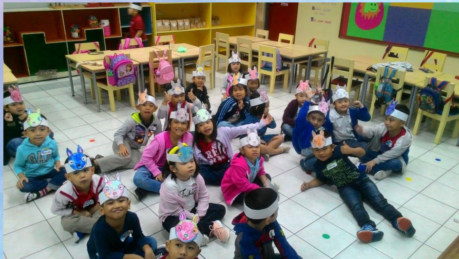
Great work. The Kindergarten pupils posing with their Llama headdresses during the Kindergarten soft opening on Saturday, June 18, 2018.