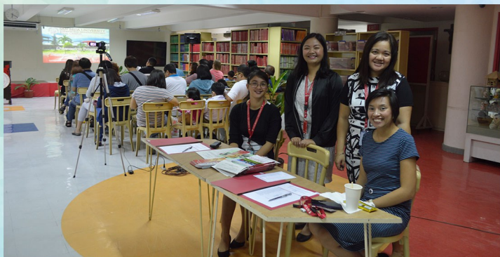
Take a break. The registration committee while waiting for the other parents.