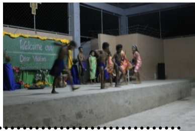
The Aetas performed an ethnic dance distinct in their tribe. They also sang songs they compose with the message of equality to reduce discrimination and care for environment