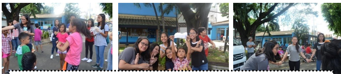
The Bedans prepared some snacks for the beneficiaries of Tahanan Walang Hagdanan