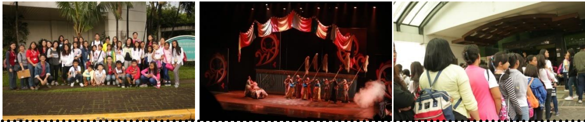
As part of the learning process of the tutees, they were given the opportunity to watch the classic Filipino stage play, " Ibong Adarna " at AFP Theater, Quezon City last September 30, 2017. It was also part of the culminating activity of the class