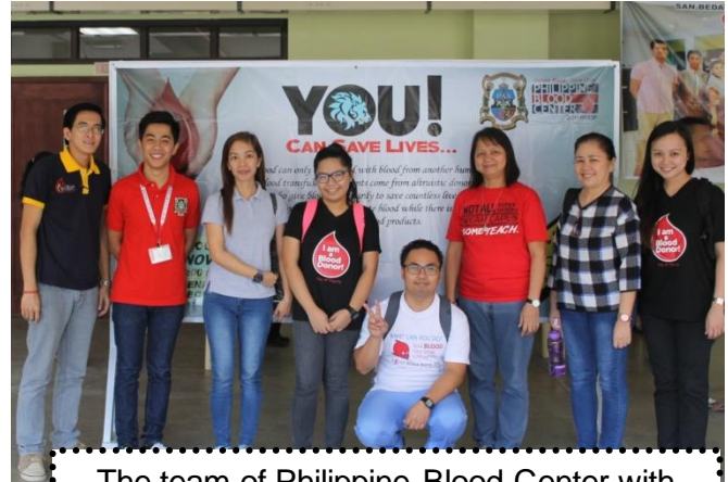
The team of Philippine Blood Center with the SAP Coordinators.