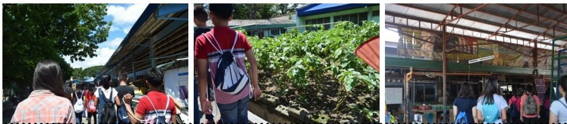
Ocular Visit at Tahanan Walang Hagdanan