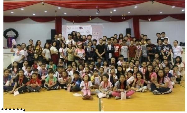
Awarding and Gift Giving with Jollibee