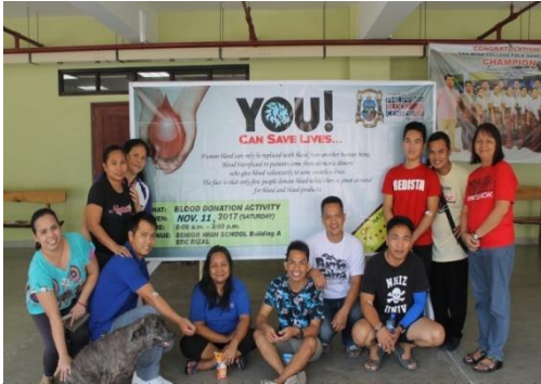
Special thanks to the Maintenance Personnel – BMS for helping and donating blood