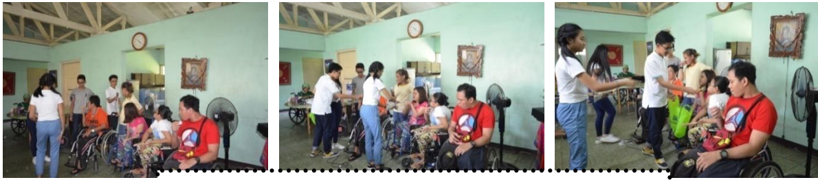
They also prepared games to the beneficiaries of TWH