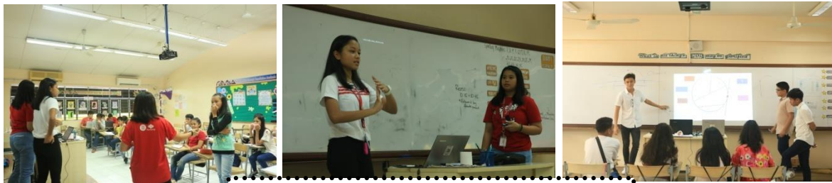
Last day of the tutorial sessions