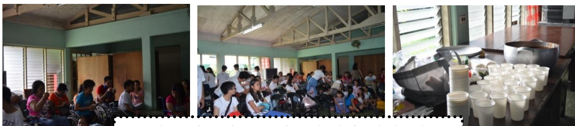
The Bedans also served snacks during the break

The Bedans serenade the beneficiaries of Tahanan Walang Hagdanan.