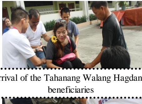
Arrival of the Tahanang Walang Hagdanan beneficiaries