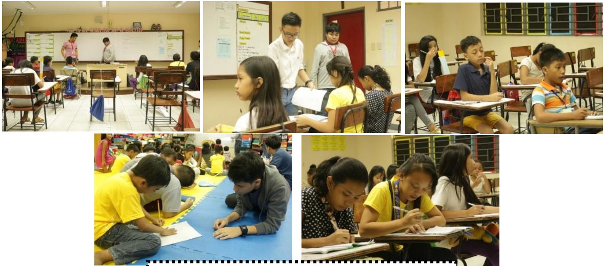
Tutees answering the Diagnostic Exam