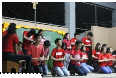
The Bedans also prepared something to showcase their talents and everyone enjoyed