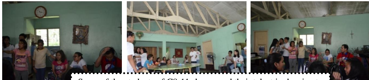
Some of the students of G8-11 showcased their talent in dancing to entertain the beneficiaries in TWH