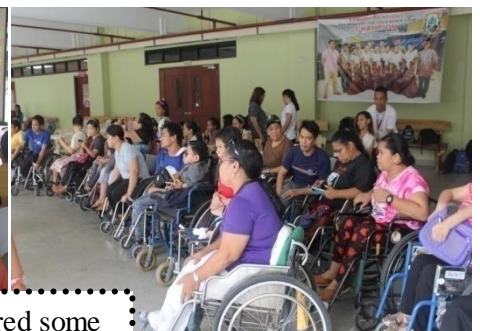
After a short welcome program, the Bedans prepared some snacks for the beneficiaries of Tahanang Walang Hagdanan