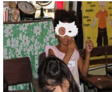
Interaction of the faculty members with the students of St. Francis Learning Center