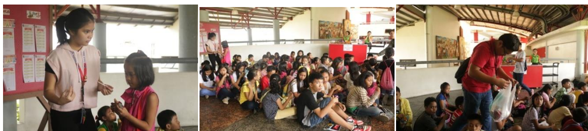
The Grade 9 served snacks for the tutees during the break.

Math, English, Science and Christian Living were the subjects taught in the said tutorial to grades 3-4, 5-6 and 9-10.