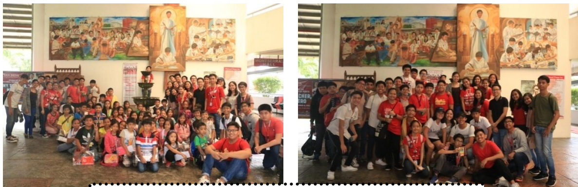
The Bedans gave some school supplies to the beneficiaries of the program