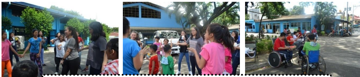
Socialized with the children of TWH