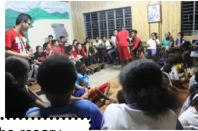
The Bedans joined the Aetas in praying the rosary